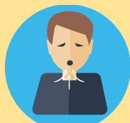
Difficulty in breathing